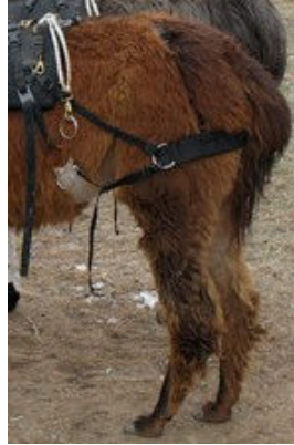
Shown in proper position for a female or gelding.